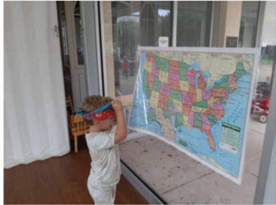
Pin Big Tex on Texas!