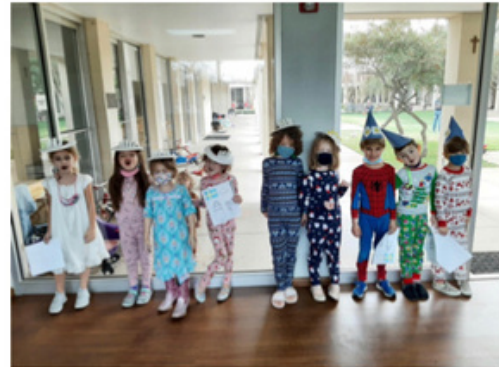
Kinders learned about St. Lucia