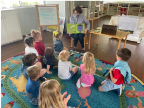
Learning about Earth Day