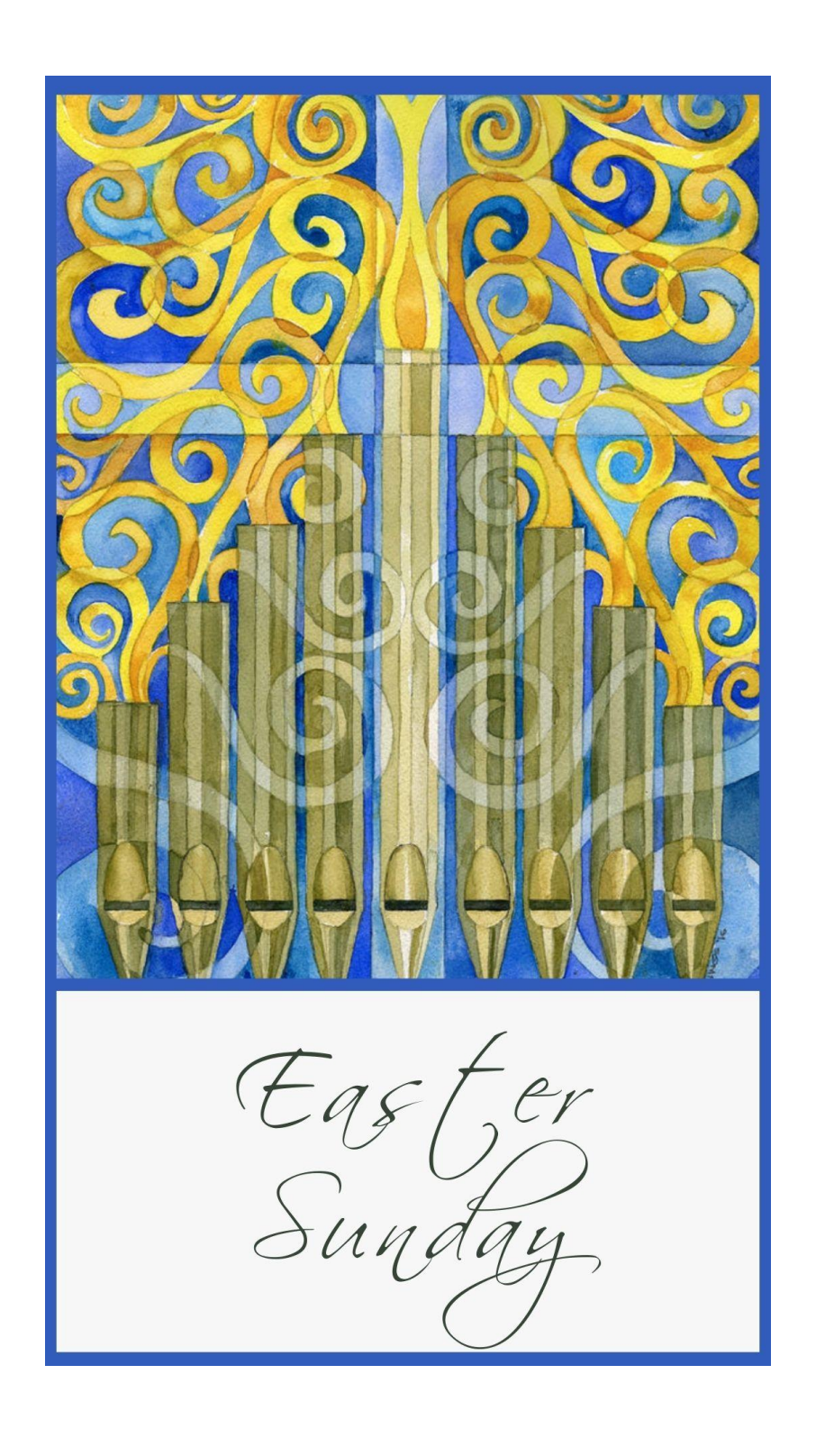
Episcopal Church of the Ascension March 31st, 2024 | 10:30 a.m.