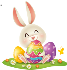
The Easter Bunny plans to stop by!